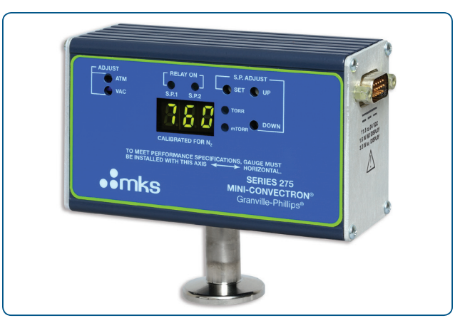
Display Side (Analog shown)