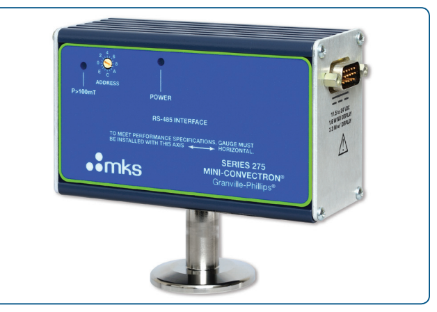
Parameter Adjustment Side (RS485 shown)