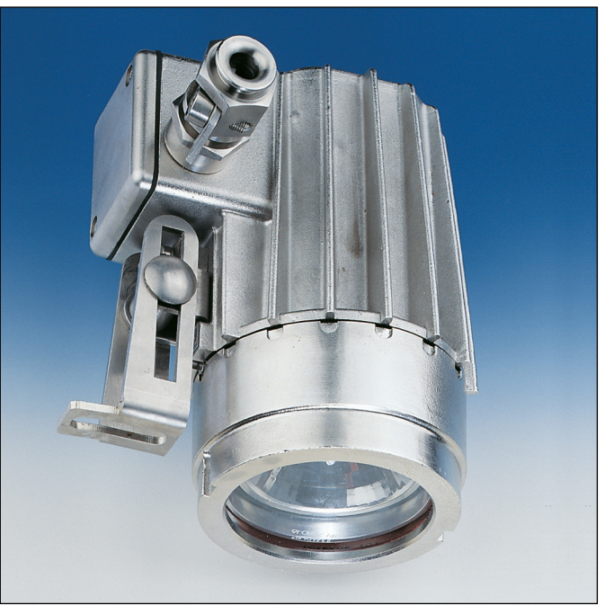
Lumistar luminaire ESL 26, stainless steel with integrated terminal box and hinged bracket fastening