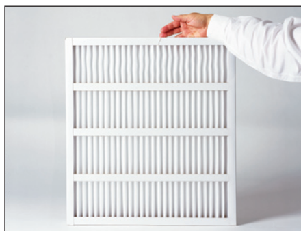
PerfectPleat memory retains integrity after damage.