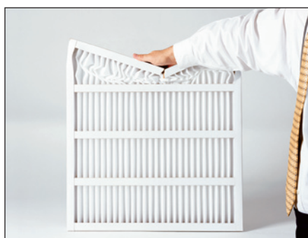
PerfectPleat can withstand significant damage.