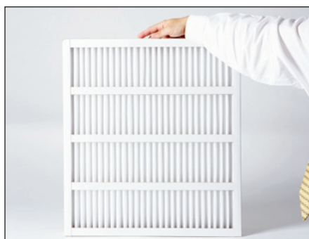
PerfectPleat: airfilter with excellent form and fit.