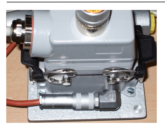
Figure 4: Main connector with heater attached.