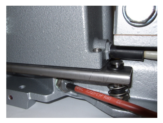
Figure 3: Base plate heating element.

If you wish to remove it the remaining hole will need to be plugged. Part-No. 10083 (Plug G1/4") and Part-No. 10054 (Seal for Plug G1/4") may be purchased for this purpose.