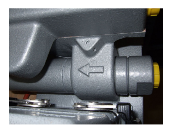
Figure 7: Air jet pump without scavenging air kit.

If your oil mist detector does not already have the air scavenging kit installed please refer to the instructions included with the kit for the proper installation procedure. You will need 22mm, 27mm and 32mm open-end spanners/wrenches to complete the installation.