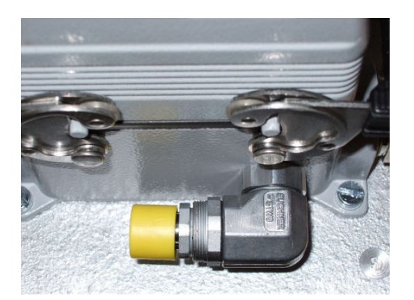
Figure 5: Main connector with heater removed and plug capped off.

After exchanging the measuring heads the main connector will need to be finalized with one of two possibilities.