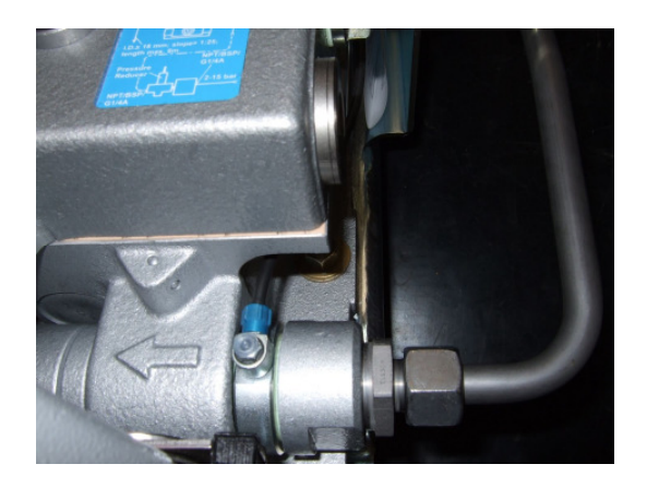
Figure 8: Air jet pump with scavenging kit installed (connector ring, seals new venture injector and hose).

If a Remote Indicator II (Part-No. 11506) is installed as the remote monitoring device the wires at pins 6 and 7 must be shifted to pins 1 and 2 according to the pin assignments of the Remote Indicator II manual.