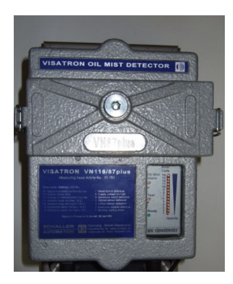
Figure 1: Measuring Head of VN87plus series.

For instructions on how to remove and install a measuring head please refer to the manual supplied with your oil mist detector.