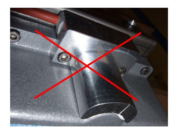
Figure 2: Measuring Head heater of the VN87-EMC series.

The measuring head of the VN87plus series (Figure 1) contains an internal heater.