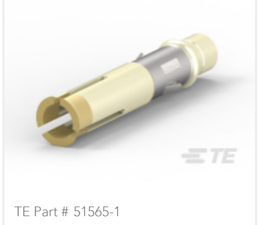
SUB MIN SOCKET