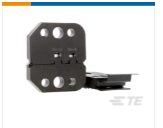
TE Part # 91900-1 PREMIUM SDE DIE, FIBER OPTIC