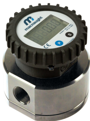
PRA Digital Register