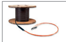
Pre assembled connectors

To reduce deployment cost and time, AP Sensing is optionally offering preassembled pig tails. This enables quick and easy onsite installation, with no need to organize a fusion splicer, splice box to get the sensing cable connected to the Distributed Temperature Sensing instrument. Pig tails are supplied with E2000 8° angled connectors. For safe transportation and installation the connectors and pig tails are covered by a flexible tube to ensure proper protection.