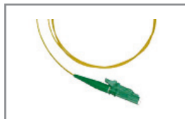
E2000 pig tail

E2000 8° angled connectors with a 5m pig tail offered to splice the sensing cables.